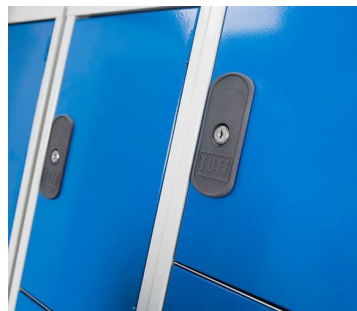
Lockers close up